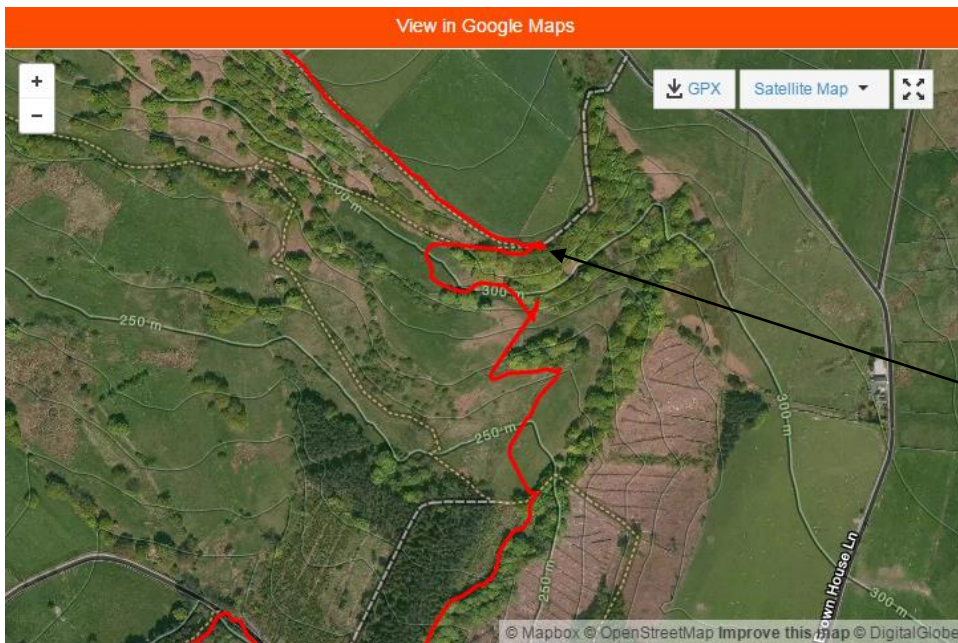
Detail from your route last week.

I came from a different (road) direction today, so joined your Sunday route here.